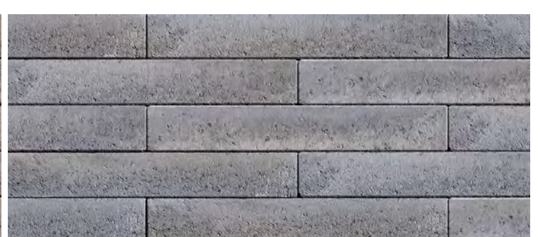
IRISH COAST SANDY BEACH