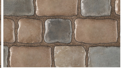
DAWN MIST / PEBBLE TAUPE