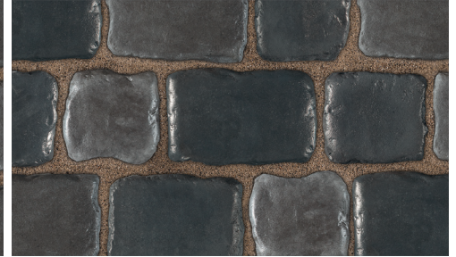
BASALT / BELGIAN BLUE