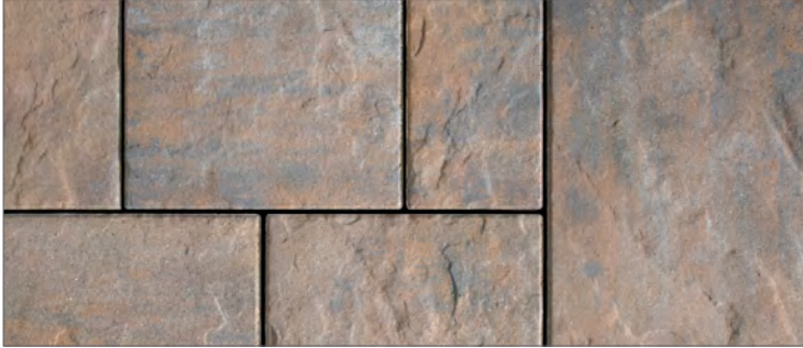
ALMOND GROVE FUSION