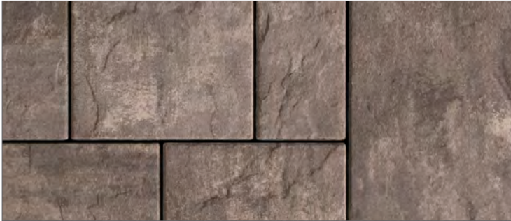
OAK BROWN FUSION